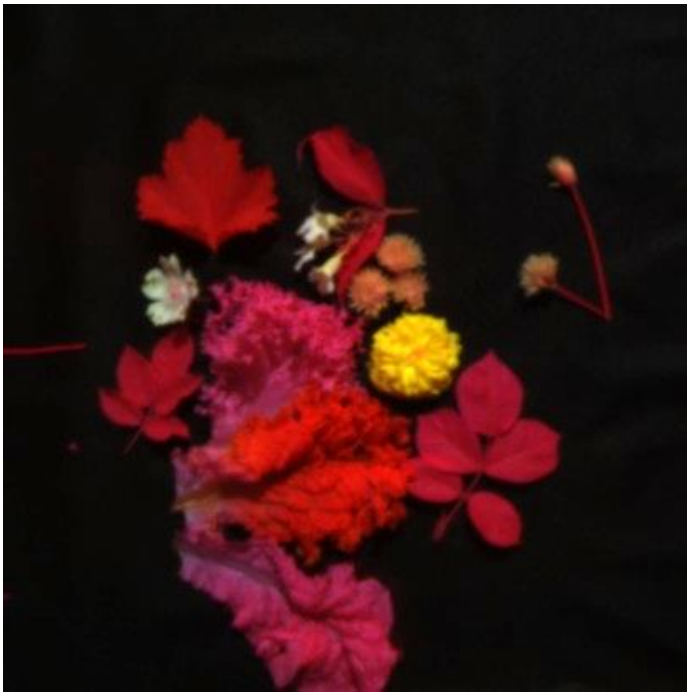
ULTRIS X20 – Colored Infrared Image in native resolution showing the high quality